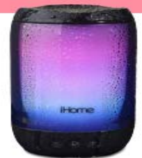
iHome PLAYGLOW+ Color Changing Waterproof Bluetooth Speaker Item 16-4033