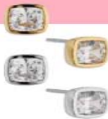
Nadri Coco Earring Set Item 06-5358