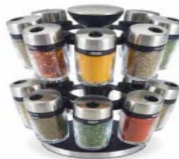
Cole & Mason 16-Jar Herb and Spice Carousel Item 07-5923