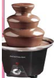
Nostalgia 3-Tier Chocolate Fondue Fountain Item 07-2393