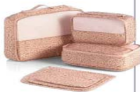
Shiraleah Uma 6-Piece Travel Organizer Set Item 14-3940