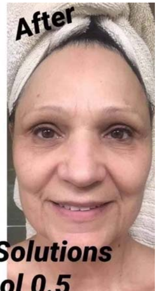
Clinical Solutions Retinol 0.5