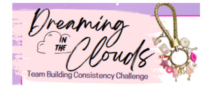
Earn your keychain and July's charm with your new team member who places a $225 w/s order!! Earn all 12 charms!...AND you could be on your way to driving FREE