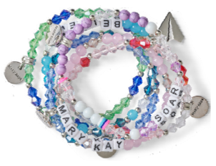
Earn with your $600 w/s order in July